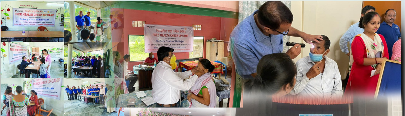
Rotary Duliajan organised Free Health Check-up Camp in our adopted village comprising Paediatric & General Medicine specialists in association with Oil India Limited Hospital & RCC of Sarupather Bongali Gaon at Phekelaian LP School on 22.11.2022. Free medicines distributed in the camp. All total of 375 students & villagers benefited.